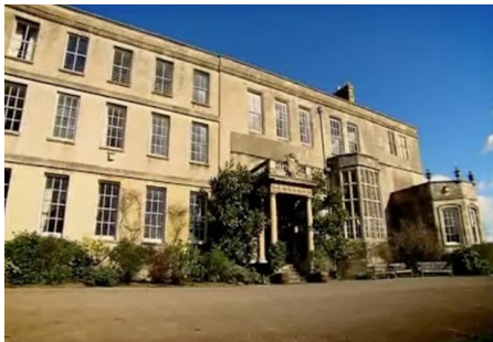
Figure 3: Emore Court

Our early thoughts were to look at recorded building work taking place near Elmore in the decade from 1730. Two sites were immediately identified as of interest as well as Elmore Court which in the early and late 18th century was altered: