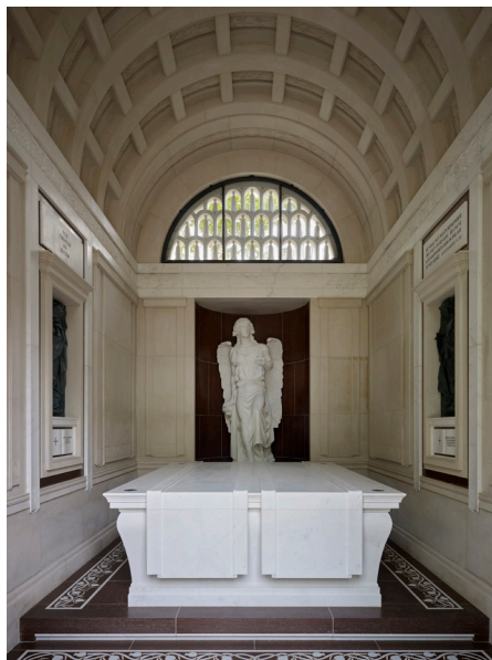
Figure 6: The angel within the Goldhammer Sepulchre