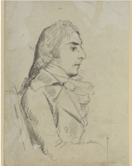
Figure 5: Sir Thomas the 2nd baronet Daniel Gardner, probably 1783

vault under the church were relocated to the mausoleum.