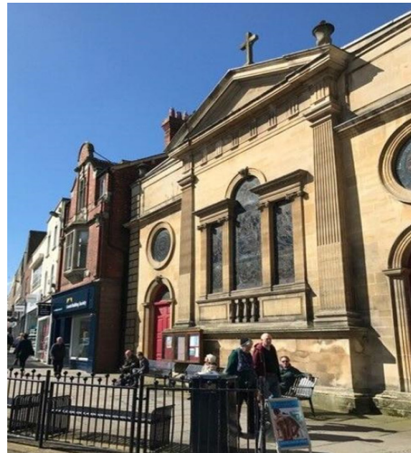
Figure 4: St John the Baptist, Gloucester.

with at its centre two tall segmental headed mullioned and transformed casement windows. That on left largely replaced except for the top three panes in the mid 18th century by a Doric order porch with three columns in row to each side sitting on bases and with balustraded parapet bearing Guise arms. There is no record of who carried out these works to Elmore Court in the 18th century.