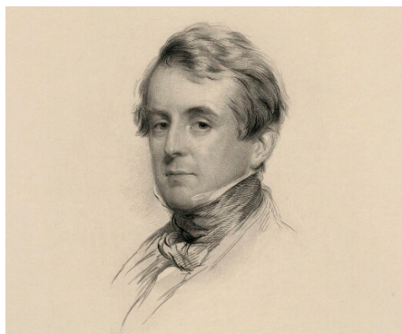
Figure 6: Sir William Heathcote 5th baronet Stipple engraving by Joseph Brown 1847 or later.

During the 5th baronet's life, there were connections with Jane Austen and, separately, John Keble (see below).