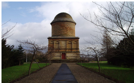
Figure 3: Hamilton Mausoleum. CC-BY-SA 2.0

We had some meetings in 2016 with South Lanarkshire Council concerning the state of the Keeper's Lodge and whether they were going to do anything about it. And basically they said 'No – but we'll sell it to you'. It was a scare tactic. But we came back with a bang!