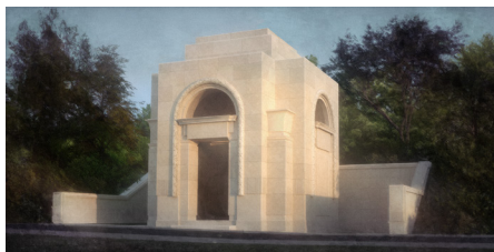
Figure 9: Unrealised design for a mausoleum © Craig Hamilton Architects

Various unrealised designs for another mausoleum at Highgate have been produced more recently (see figures 9, 10 and 11). These continue to explore the idea of the classical mausoleum paying homage to diverse dead architectural heroes. In this case Friedrich Gilly and two great American Mausoleum designers of the early twentieth century: John Russell Pope and James Gamble Rogers. It seemed all the more appropriate to be making reference to these architects after the recent discovery that the Cheylesmore Mausoleum at Highgate (see figure 12), dating from 1927, was designed by the office of Carrere and Hastings.