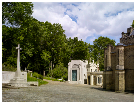
Figure 5: The Goldhammer Sepulchre west elevation

These stylized drapes are a theme which is used on the interior as well. Alexander Stoddart's marble angel is the focus of the interior, located in an apse and presiding over the double sarcophagus ( figure 6 ).