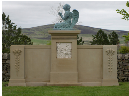
Figure 2: A memorial in the north of Britain

The crypt in the chapel at Culham has interment chambers below the stone floor in the nave. The groin vaulted nave is supported on Ballinasloe Doric stone columns and this same stone is also used for the solid stone crypt entrance doors. The use of stone doors is, of course, a reference to the "heavy stone" which closed Christ's tomb and the story of Christ's entombment and subsequent Resurrection is depicted in the bas-reliefs by Alexander Stoddart which surround the crypt doors (see figure 3). Within the tympanum the two shining angels which Mary Magdalene saw when she looked into the empty tomb are shown, seated either side of the empty bier stone, and within the door reveals are two small bas