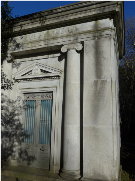
Figure 12: The Cheylesmore mausoleum.