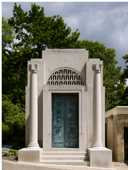
Figure 4: The Goldhammer Sepulchre at Highgate Cemetery