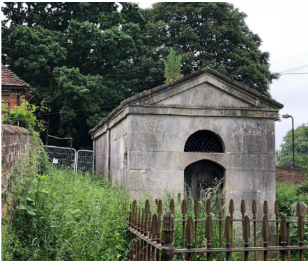
Figure 3: The Lowndes mausoleum in Chesham, tucked at the back of the churchyard, fenced and overgrown.

become even more vulnerable to attack by those who think there are contents worth stealing. It is understandable, if rather dispiriting, if some owners find it easier to keep the site secured with no public access. This is a shame: people need to see mausolea - at least externally - in order to appreciate them. Most were designed to impress and are often highly decorated on the exterior with a plainer interior.