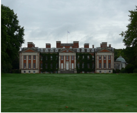
Figure 4: Hursley House today (NB Extensive alterations were carried out after the house was sold by Joseph Baxendale in 1902 to Sir George Cooper who was married to a very wealthy American heiress)