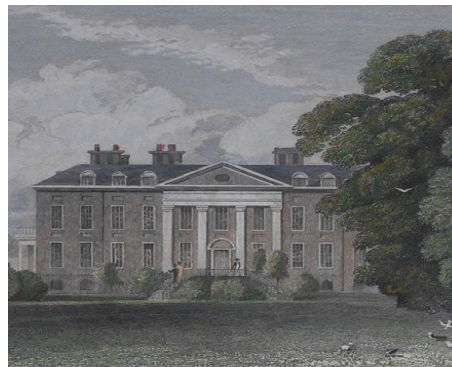
Figure 3: Hursley House 1827