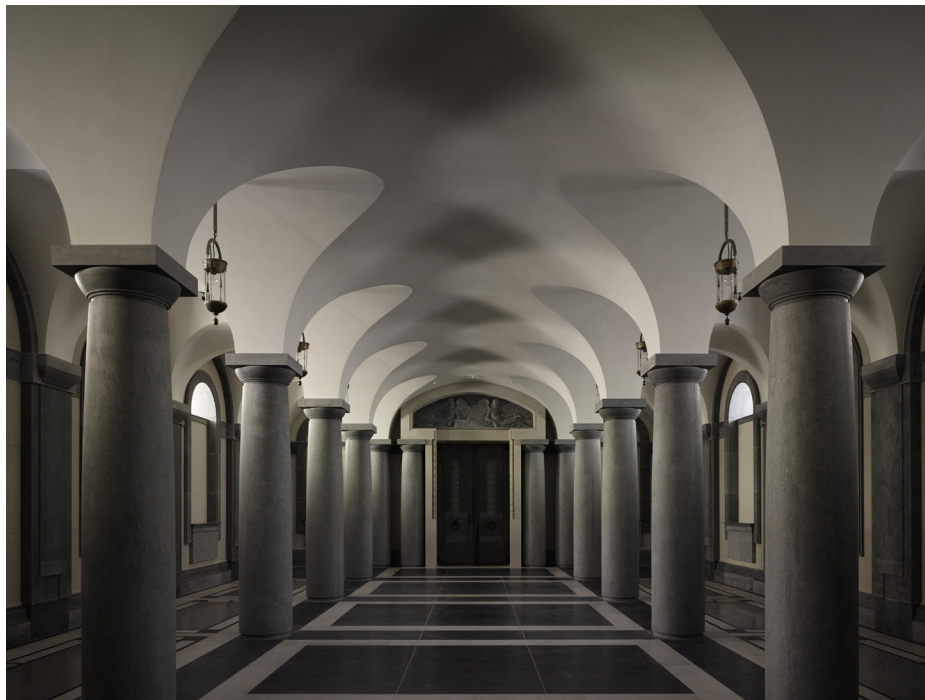
Figure 1: The Crypt in The Chapel of Christ the Redeemer at Culham.

The tradition of architects designing mausoleums has a long and noble history, although in the latter part of the twentieth century this tradition fell into decline. Given this decline, it came as a very welcome surprise in 2011 to be asked to design a new mausoleum in Kensal Green Cemetery, especially as, for a classical architect, one cannot imagine a