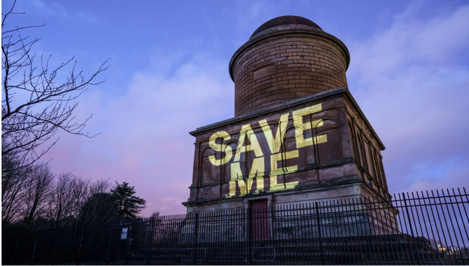
Figure 1: A call to arms projected onto the Hamilton Mausoleum in March 2020

Few mausolea share the same level of local affection as the Hamilton Mausoleum. Built between 1842 and 1858 for Alexander, the 10th Duke of Hamilton (1767-1852), in the grounds of his opulent palace, the Mausoleum occupies a prominent location in its namesake South Lanarkshire town.