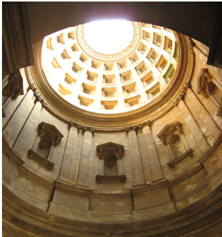
Figure 4: Hamilton Mausoleum interior

It's the last remnant of Hamilton Palace, which was the most palatial house outside of royalty in the UK. It even had a throne room, because they wanted to be prepared in case they were ever asked to become the new Kings of Scotland! But when I've been speaking to people it's always to do with childhood memories. Most people used to be taken by their schools and it was very accessible – even in my time we were doing daily tours. Now it's open about once a month. One of our members who's 92 years old was reminiscing about her mother singing in it because the echo is spectacular.