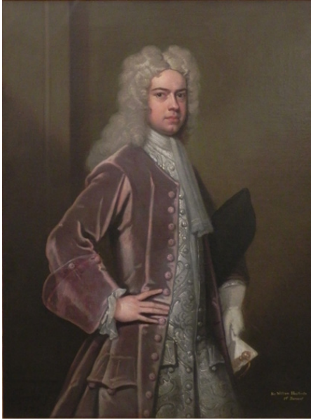
Figure 2: Sir William 1st baronet Oil painting by Sir Godfrey Kneller 1721

He also purchased additional land around Hursley, plus an estate in Ireland and a house in St James' Square London. In 1722 he was elected MP for Buckingham and in 1723 was Deputy Lieutenant for Hampshire. His parliamentary career continued when he was elected MP for Southampton in 1729, sitting until 1741.