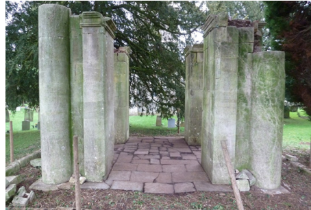
Figure 1&2: Guise Mausoleum, Elmore

The work so far, however, has allowed us to understand in detail the condition of the standing structure – very good, bearing in mind it collapsed more than a century ago – and to appreciate its exceptional architectural quality. Here are two photos taken in February.