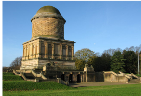
Figure 5: Hamilton Mausoleum

long time and that's something that needs to be looked at. Another thing that we'd like to do is raise some money to restore the doors, but that's a long way down the line at the moment. We're very ambitious!