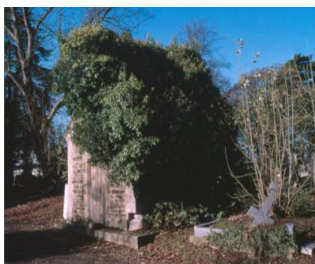
Figure 1&2: Squires Mausoleum, New Southgate Cemetery