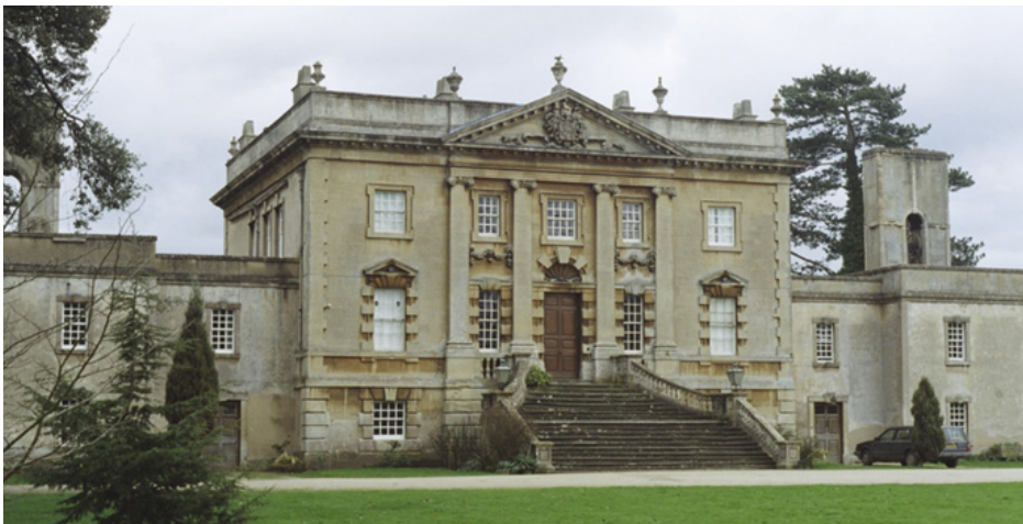
Figure 5: Frampton Court © Images of England Mr John Leaver Reference: IOE01/13897/06 Date: 12 February 2005

We would welcome the views of readers as to the possible designer and/or builder of this early neo-classical mausoleum pictured below.