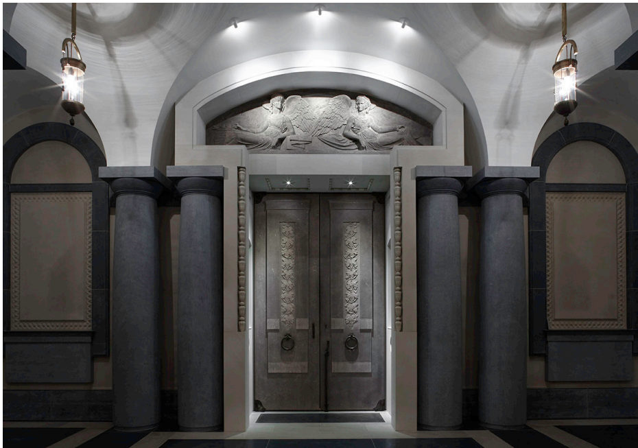
Figure 3: Crypt doors in The Chapel of Christ the Redeemer at Culham

The bronze entrance doors incorporate the pomegranate as a symbol of the Resurrection and the two freestanding stone columns either side are topped by a capital which is an abstract sarcophagus draped with stiff stone drapes (see figure 5).