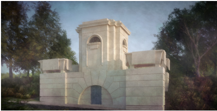
Figure 10: Unrealised design for a mausoleum

It is very encouraging that there are once again patrons who are prepared to commission mausoleums of quality that will continue this important and honourable tradition and to leave to posterity buildings that not only do honour to the dead but also serve as works of art and a sign of continued civilisation in the early twenty-first century.