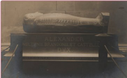
Figure 2: Duke of Hamilton's sarcophagus

with 16 of his ancestors. A keen Egyptophile, his body was embalmed and mummified, then placed in a sarcophagus, originally purchased for the British Museum, and put on a marble plinth in the chapel, where it remained until being re-interred at the nearby Bent Cemetery in 1921.