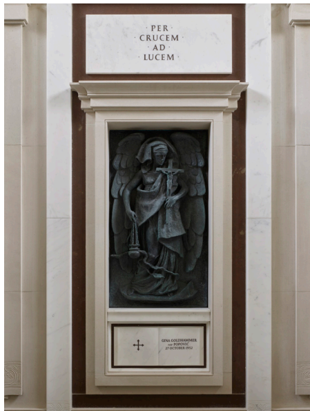
Figure 7: Goldhammer Sepulchre allegorical figure of Faith