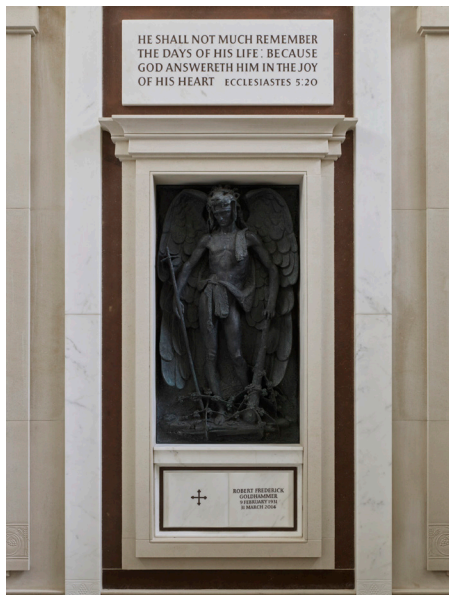
Figure 8: Goldhammer Sepulchre allegorical of Fortitude

either side of the room (see figures 7 and 8). The interior is lit naturally through stone carved thermal windows at either end of the space.