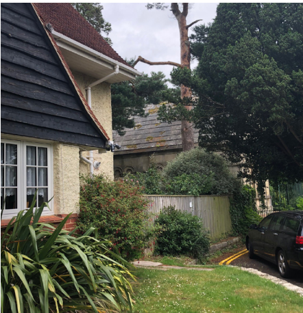
Figures 1 & 2: The Packe mausoleum, hidden in the residential streets of Poole.